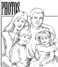
Now being taken for the Church Directory

It's time to update our membership directories. If you are a member and have never had your picture taken or would just like to update your existing picture this is the time for you. We will be taking pictures on Sunday mornings on all Sundays in February. Just come to the upper atrium between 9:30 and 10:30 and someone will be there to take your picture. It is important for our new members to get to know their new church family so please make every effort have your picture made.