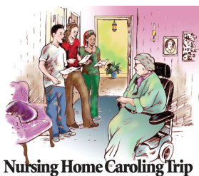
Nursing Home Caroling Trip

On Sunday, December 12 we will meet and leave the church by 2:00 pm to go caroling at Eagle Crest Villa and Azle Manor Nursing Home.